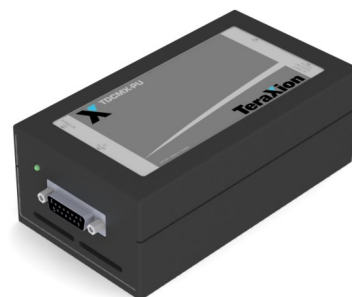
Power and Communication Module