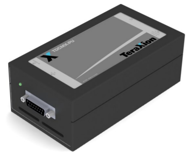
Power and Communication Module